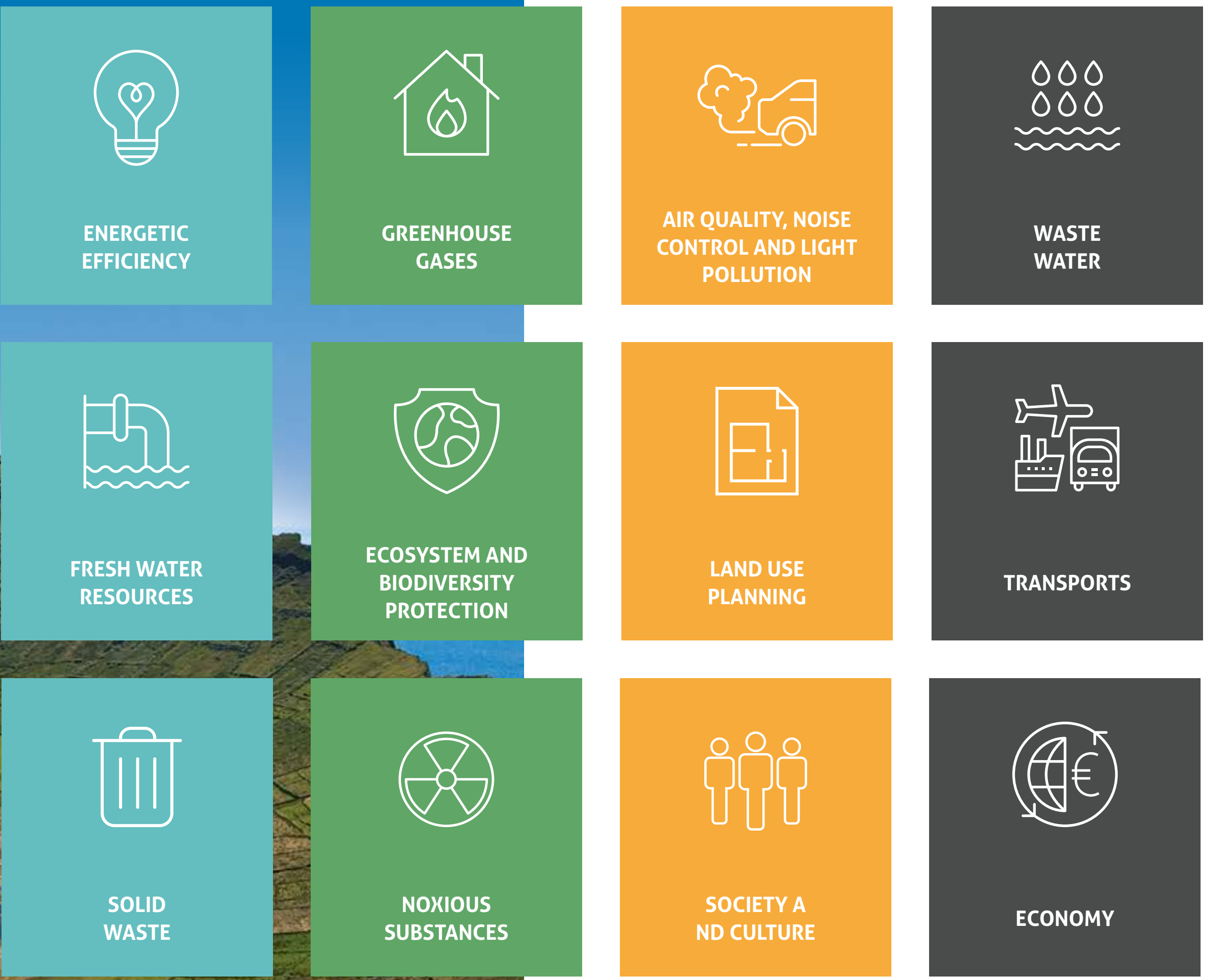
Áreas de certificação chave (KPAs)